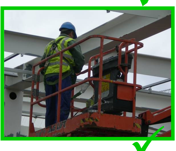
For further information on Health and Safety related issues go to www.hsa.ie